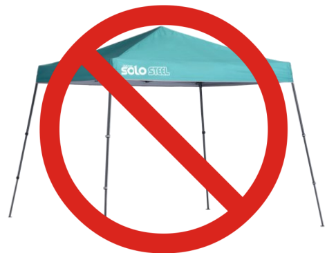
No Slanted Legs