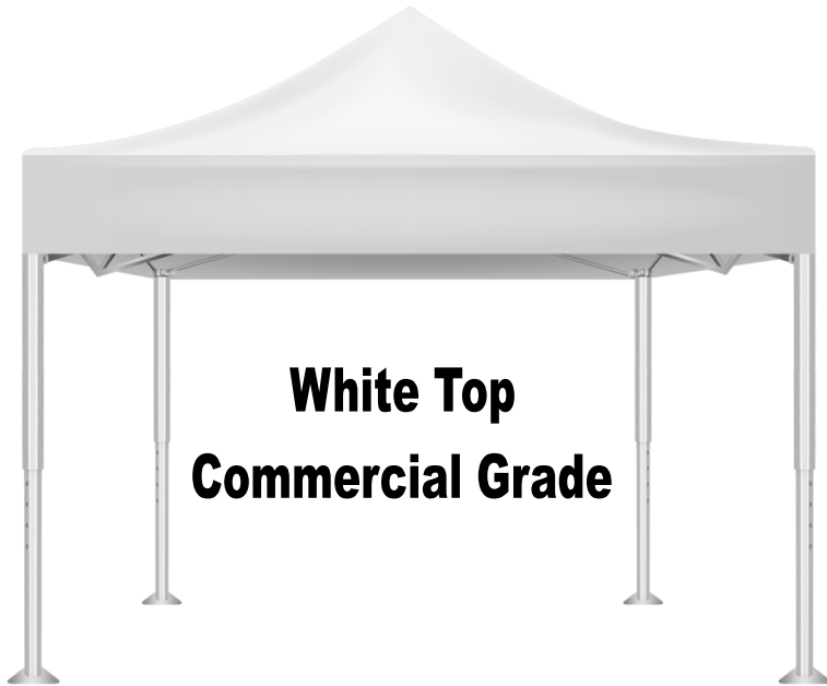
White Top Commercial Grade